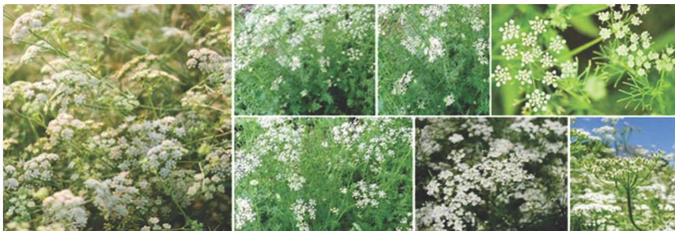
Fig. 1: Cumin herb and Inflorescence.

as it helps in losing weight, improving digestion and immunity, and treating skin disorders, boils, piles, insomnia and respiratory disorders. [5-6]