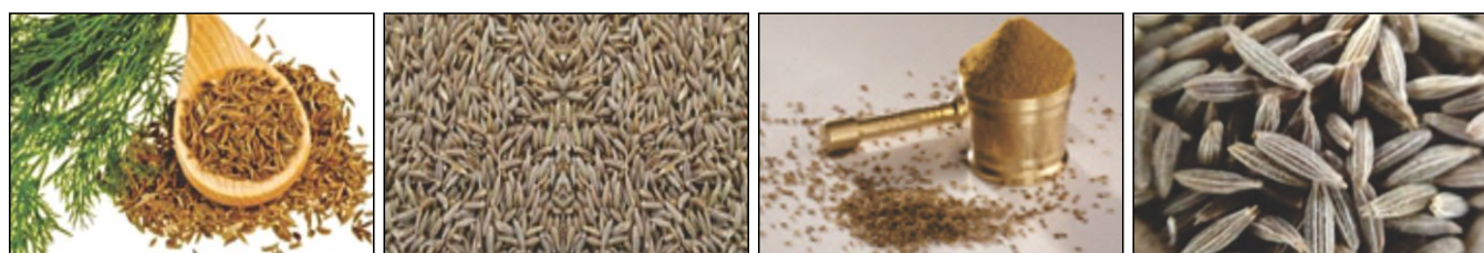
Fig. 3: Images of cumin seeds and powder.

dienoate. The characteristic odour of cumin was attributed to the presence of cinnamaldehyde, 1, 3-p-menthadien-7-al, 1-4-pmenthadien-7-al. 14 free amino acids were also isolated from the seeds. While, flavonoid glycosides isolated from the plant were included apigenin-7-glucoside, luteolin-7-glucoside, luteolin-7-glucuronosyl glucoside, luteolin and apigenin. Total polyphenols in cumin were 4.98 \pm 0.31. (mg GAE/g DW). Phenols (salicylic acid, gallic acid, cinnamic acid, hydroquinone, resorcinol, p-hydroxybenzoic acid, rutin, coumarin, quercetin) were isolated from seeds of Cuminum cyminum . However, Cuminum cyminum roots, stems and leaves, and flowers were investigated for their total phenolics, flavonoids, and tannins contents. In all Cuminum cyminum organs, total phenolics content ranged from 11.8 to 19.2 mg of gallic acid equivalents per gram of dry weight (mg of GAE/g of DW). Among the polyphenols studied, 13 were identified in roots, 17 in stem and leaves, and 15 in flowers. The major phenolic compound in the roots was quercetin (26%), whereas in the stems and leaves, p-coumaric, rosmarinic, trans-2-dihydrocinnamic acids and resorcinol were predominant. In the flowers, vanillic acid was the main compound (51%). A total of 19 phenolic compounds were successfully identified during the ripening of cumin seeds. Rosmarinic acid was the major phenolic acid for the unripe seeds, while, half ripe and full ripe seeds were dominated by p-coumaric acid. [5-20]